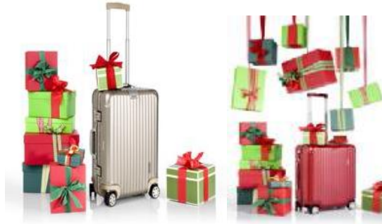
Topas Titanium Cabin Multiwheel® Dimensions: 57.0 cm x 44.5 cm x 25.0 cm $1,340.00

Every year we ask ourselves what is the perfect present? By no means a last-minute gift, but something that is both practical and stylish: the Salsa Deluxe series suitcases, available in four dazzling colors, and the sophisticated Topas Titanium series models leave you spoiled for choice as there is certainly something there for all of your loved ones!