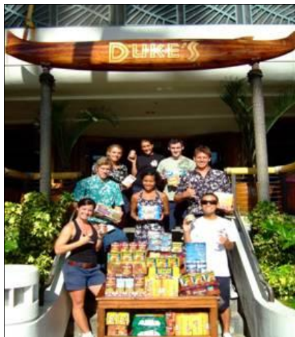
Staff at Duke's Waikiki