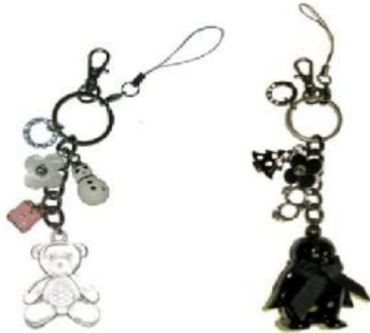
Christmas "Splendore" Charms (4 different types) with purchase of $550 or more

Receive a free Christmas "Splendore" Charm with purchase of $550 or more at the Waikiki store or the Ala Moana store from December 15. You can pick from 4 different types of charms including cute bear and penguin with each holiday motifs such as snowman and Christmas tree while supplies last. The charm can be used for cell phone strap or key holder other than bag charm.