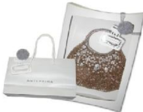
Christmas Wrapping With Special Perfume Bottle Ornament

Both the Waikiki store and the Ala Moana store offers free gift wrapping service to customers with purchase of any WIREBAG or pouch starting from December 15. The special Christmas wrapping comes with a very special limited edition Antepima perfume bottle motif ornament while supplies last. You can choose from two types of ornament designs available in two colors; white or gray. If you are looking for the ideal gift for your loved one, give them a beautifully wrapped Antepima WIREBAG.